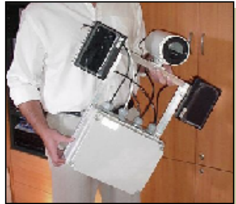
New WipFrag Reflex Probe

This latest equipment from WipWare automatically "senses" the presence of vehicles and vessels, identifies them, sizes the contents, creates a data log of this information and makes it available to all those requiring this information via LAN or existing data management software.